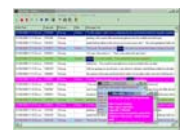
LogPage Software (see below)