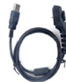
Programming Cable (USB Port) PC38