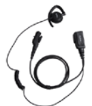
Earset Swivel EHN17