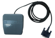
Foot Switch (External PTT) POA44