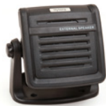
External Speaker Microphone SM09D1