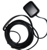
GPS Antenna (optional) GPS04